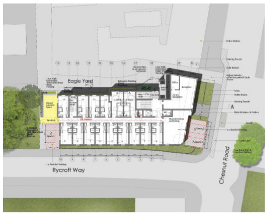
Proposed ground floor plan